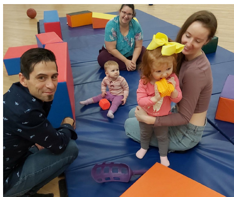
Alberta Avenue Community League

Our Parent and Child Drop-in Groups returned to pre-COVID numbers and were once again held in multiple locations throughout Edmonton.