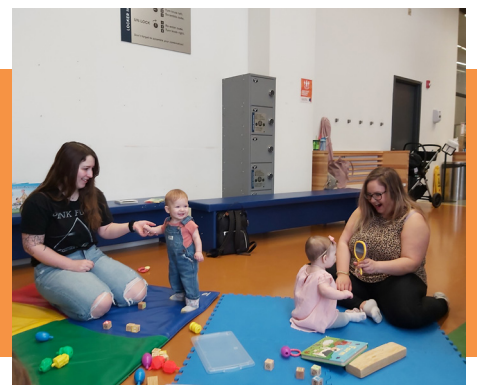
Clareview Recreation Centre

In Parent Education Groups, parents were able to learn together face-to-face and to connect with each other to strengthen their support networks.