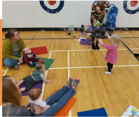
Rundle School / Beverly Daycare Society