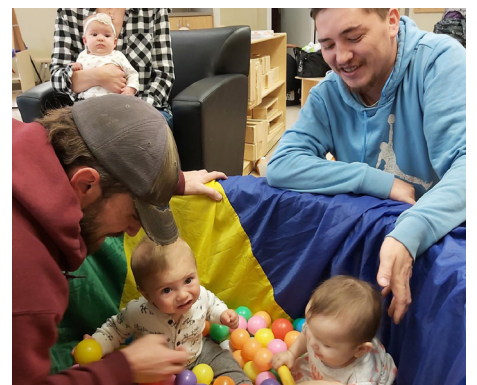
Norwood Child and Family Resource Centre

Our Parent and Child Drop-in Groups returned to pre-COVID numbers and were once again held in multiple locations throughout Edmonton.