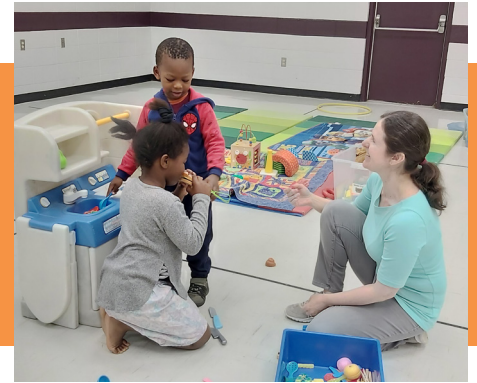
McLeod Community League