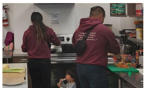
Family Table at the C5Northeast Hub