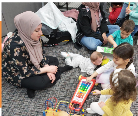
Al Rashid Mosque