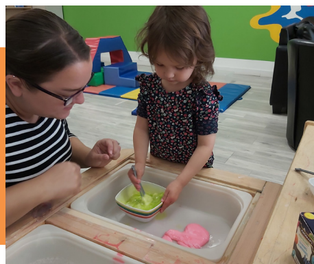
Northeast Community Hub