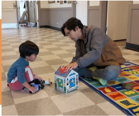
Riverdale Community Hall